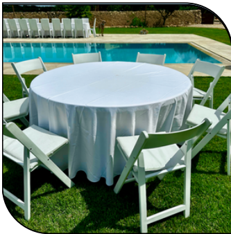
ROUND TABLE + CEREMONY CHAIR