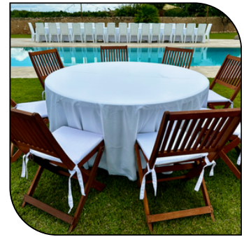
ROUND TABLE + TEAK WOOD CHAIR