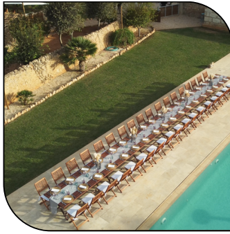
WOODEN TABLE TEAK WOOD CHAIR