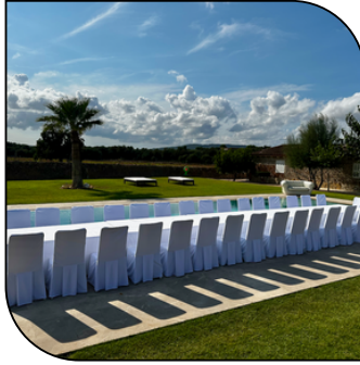
RECTANGULAR TABLE + CHAIR COVERS