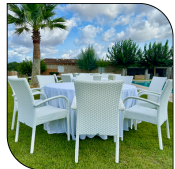
ROUND TABLE + RATAN WHITE CHAIR