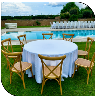
ROUND TABLE + CROSSBACK CHAIR