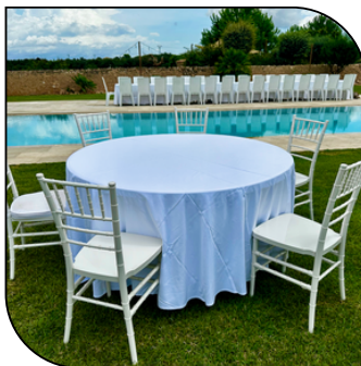
ROUND TABLE + TIFFANY CHAIR