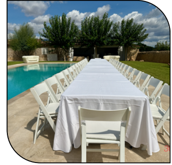
RECTANGULAR TABLE + CEREMONY CHAIRS